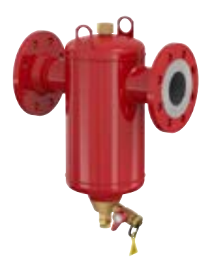
FLAMCO CLEAN SMART F