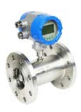
GAS TURBINE FLOW METER