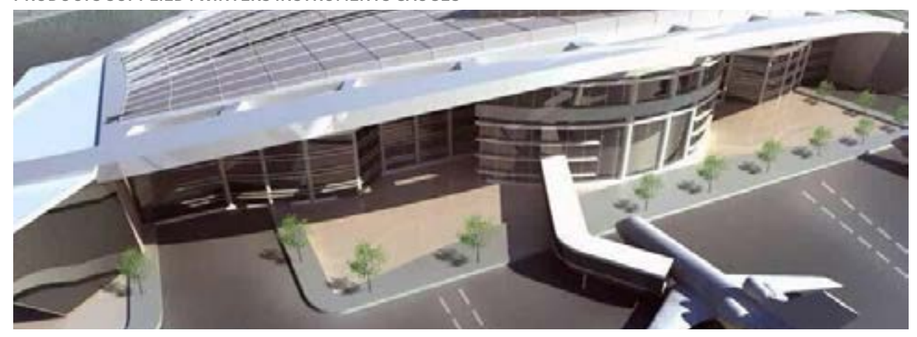
PROJECT NAME: GRANADA MALL RIYADH

PRODUCTS SUPPLIED: WINTERS INSTRUMENTS GAUGES