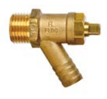
DZR BRASS DRAINING COCK