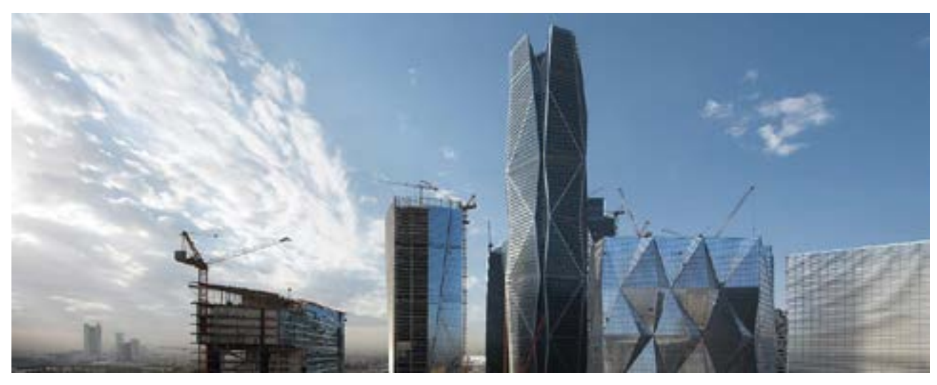
PRODUCTS SUPPLIED: WINTERS INSTRUMENTS GAUGES