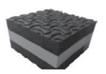
GREEN TRI-PLE-CORE RUBBER FOAM PAD