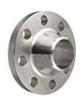
STAINLESS STEEL (WNRF) WELD NECK FLANGE