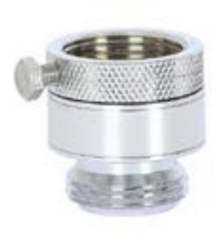
SS BRASS BODY VACUUM BREAKER