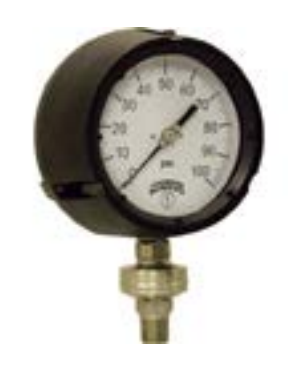
PTR TAMPER-RESISTANT GAUGES