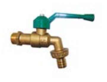
BRASS BIBCOCK WITH HOSE UNION