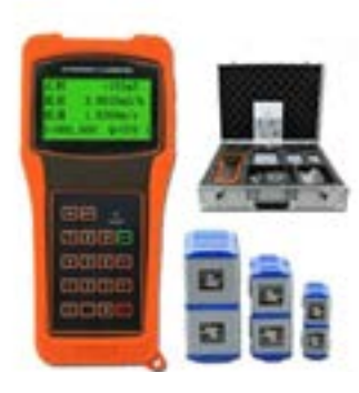
HANDHELD ULTRASONIC FLOWMETER