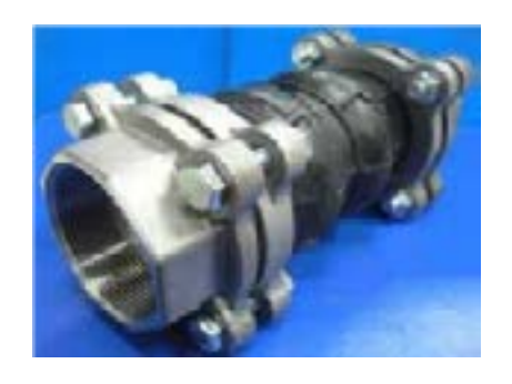
RUBBER EXPANSION JOINTS, SCREWED CONNECTION