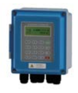
WALL MOUNTED ULTRASONIC FLOWMETER