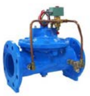
SOLENOID ON/OFF CONTROL VALVE