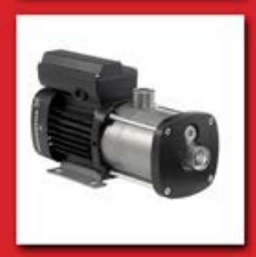
"Premium and quick solutions with value engineering"