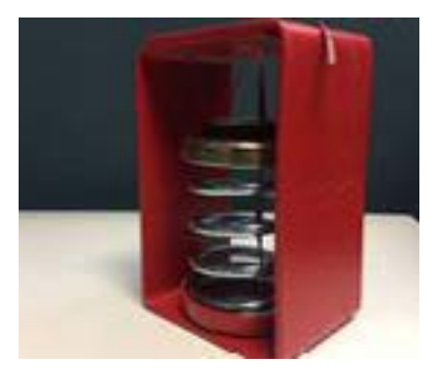
HNSA NEO-SPRING HANGER