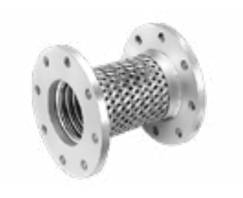
BRAIDED SS FLEXIBLE CONNECTOR