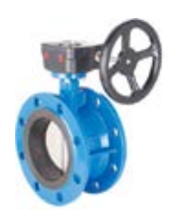
SERIES EMD-F FLANGED BUTTERFLY VALVE