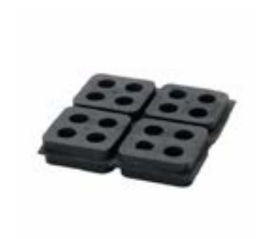
EASY-CUT RUB-BER MOUNTING PAD