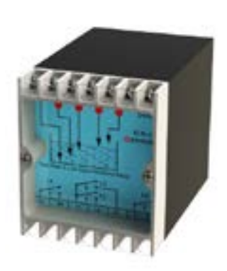
ELR SERIES ELECTRONIC LEVEL RELAY

This electronic level relay mounted in control panel with required terminals configured to applications to suit project requirements.