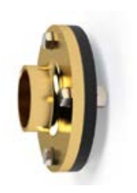
DIELECTRIC FLANGE PIPE FITTINGS E300