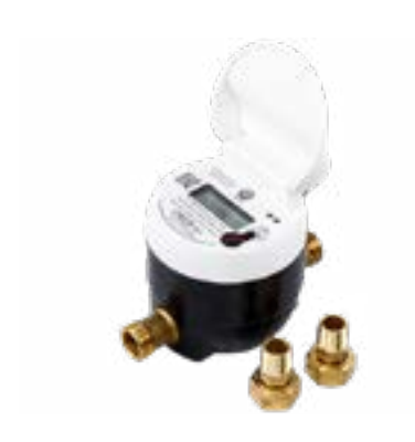
ULTRASONIC DOMESTIC WATER METER