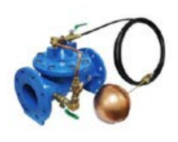
MODULATING FLOAT CONTROL VALVE