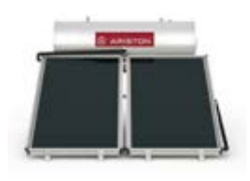
ARISTON DOMESTIC WATER HEATER