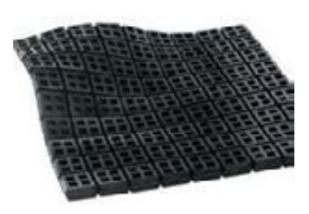
STEEL RUBBER MOUNTING PAD