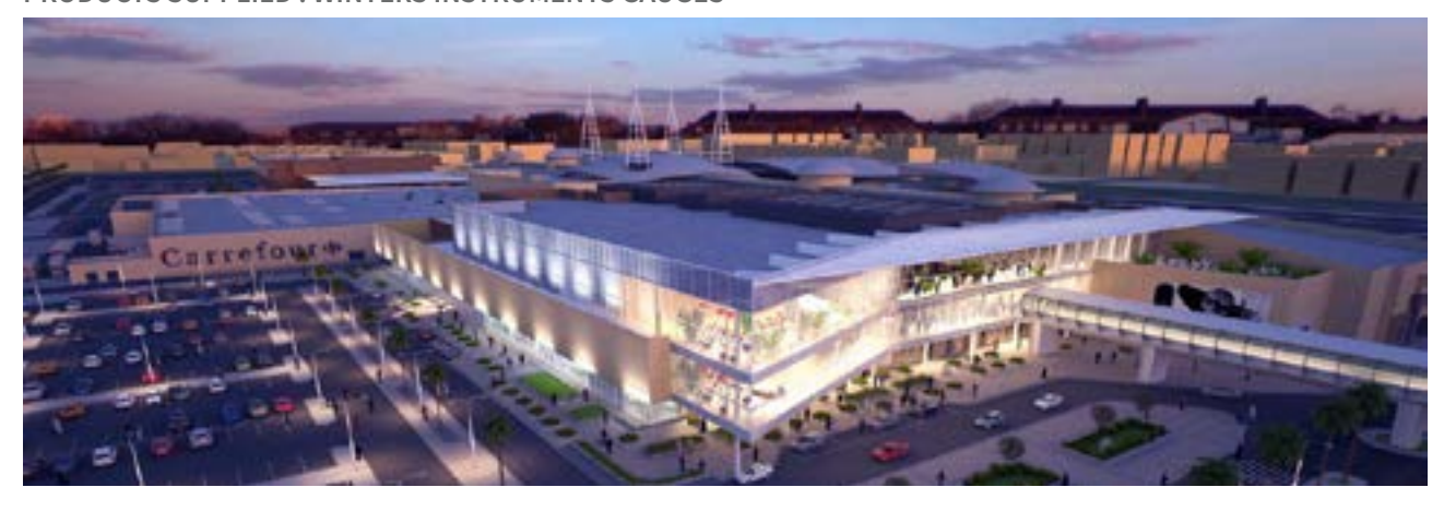
PROJECT NAME: SAUDI ELECTRICITY COMPANY HQ

PRODUCTS SUPPLIED: WINTERS INSTRUMENTS GAUGES