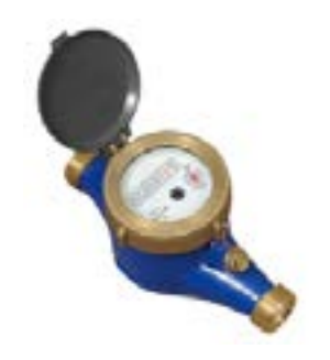
MULTI-JET DRY TYPE VANE WHEEL WATER METER