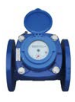
WOLTMAN (TURBINE) WATER METERS