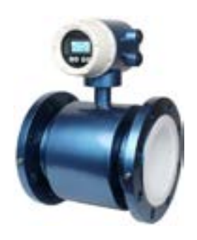
ELECTROMAGNETIC FLOW METER

Alyamitech offers Plumbing Accessories such as Water Hammer Arrestor, Trap Primer, Vacuum Breaker, multi-jet impeller meter and Woltman Turbine Water Meter products. We distribute Plumbing Accessories products from Triage Engineering, Envotech as well as Surgetrol products from Sealtech.