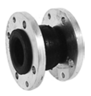
FCS RUBBER EXPANSION JOINTS

Vimco also manufactures rubber expansion joints, rubber foam pad, rubber mounting pads, control rods, stainless steel expansion joints and more.