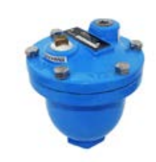
AUTOMATIC AIR VENT