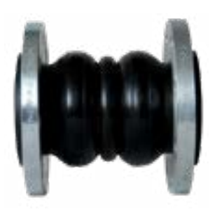
DOUBLE SPHERE FLANGED RUBBER EXPANSION JOINT