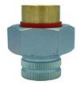
DIELECTRIC UNIONS DUFF