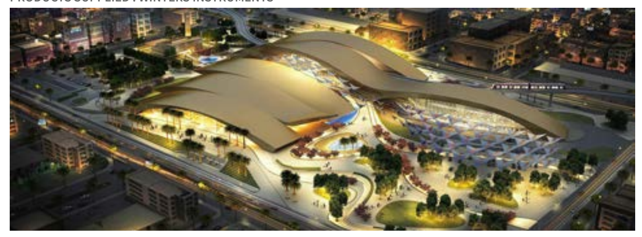
PROJECT: RIYADH METRO STATIONS 1A1,1F8,1C1,1B3 PRODUCTS SUPPLIED: WINTERS GAUGES & AGF VALVES