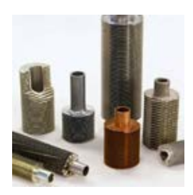
FINNED TUBE HEAT EXCHANGERS