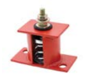
SEISMIC SPRING MOUNT-1 DEFLECTION