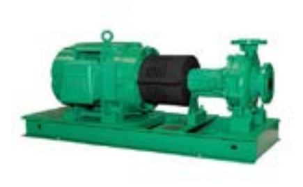
BASE MOUNTED END SUCTION PUMP