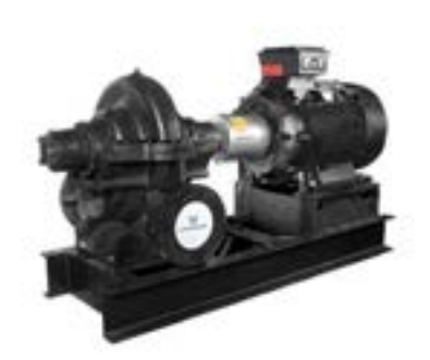
HORIZONTAL SPLIT CASE PUMPS