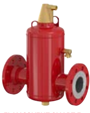
FLAMCOVENT SMART F