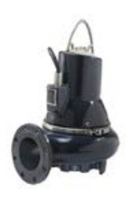
SUBMERSIBLE WASTEWATER PUMPS