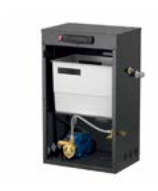
FLEXFILLER PRESSURIZAITON EQUIPMENT