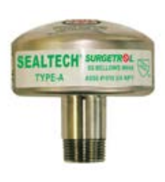
SEALTECH SURGETRO SS BELLOWS WHA