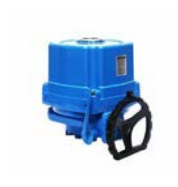
ON/OFF TYPE EOHQ SERIES ACTUATOR