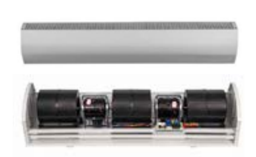
CENTRIFUGAL MOTOR AIR CURTAIN