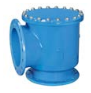
DUCTILE IRON SUCTION DIFFUSER PN-16