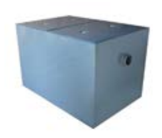
ENVOTEC SAND-MUD INTERCEPTOR EIG