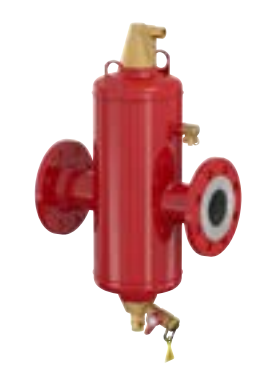
FLAMCOVENT CLEAN SMART F