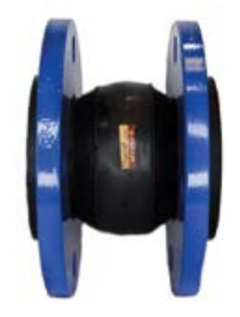
FLANGED SINGLE SPHERE RUBBER BELLOW, PN16

These are available in different sizes suitable for specified pressure ratings. Flexible Hoses are available in PN16 and PN25 ratings.