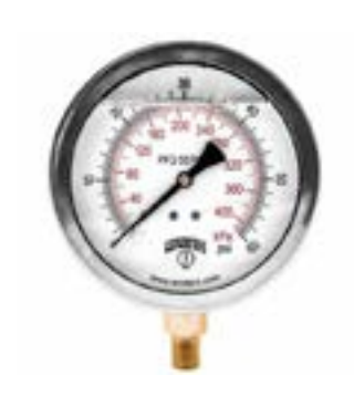
PFQ GLYCERIN FILLED GAUGE

Winters Instruments is a Canadian based company with line of products in pressure gauges, pressure transmitters, pressure switches, diaphragm seals, thermometers, RTDS, thermocouples, thermometers and thermowells.