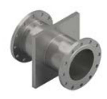
EPF PUDDLE FLANGE