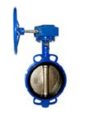
DUCTILE IRON BUTTERFLY VALVE