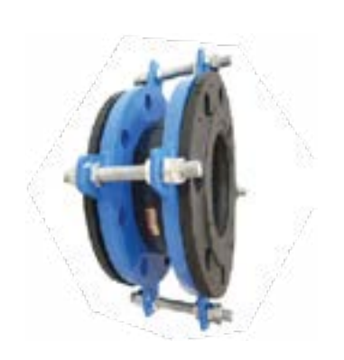
FLANGED SINGLE SPHERE WITH CONTROL RODS