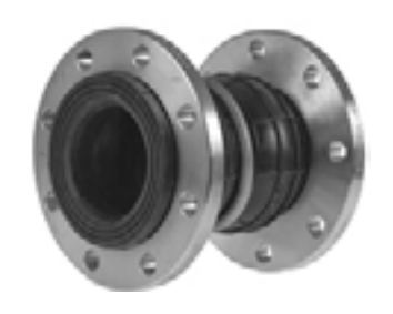
EXPANSION JOINTS, TWIN BELLOW, FLANGE CONNECTION