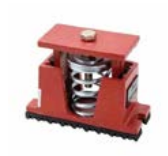
VIMCO HOUSED SPRING MOUNT