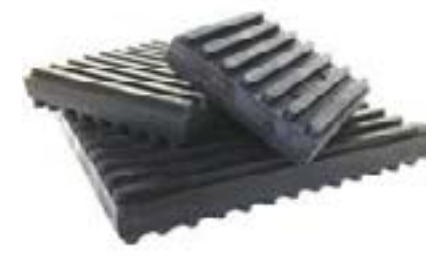
FMD RUBBER-IN-SHEAR MOUNT