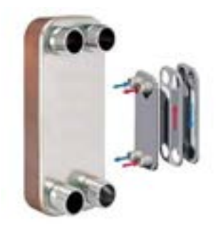
BRAZED PLATE HEAT EXCHANGERS

Maxwor is different types of heat exchangers like Gasketed Plate Heat Exchangers, Brazed Plate Heat Exchangers, Shell & Tube Heat Exchangers and Finned Tube Heat Exchangers. They also make rubber, metal and fabric expansion joints. Metal expansion joints include AN Type Expansion Joint, AX Type Expansion Joint and LA Type Expansion Joint.