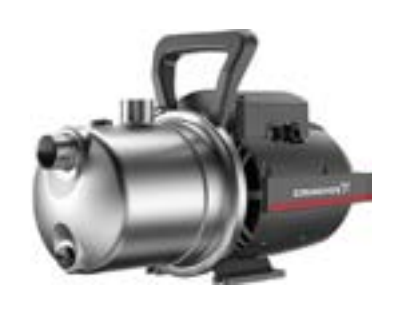
PUMP BOOSTER SET