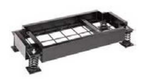
INERTIAL BASE FOR PUMPS