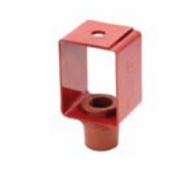
RUBBER-IN-SHEAR DOUBLE DEFLECTION HANGER

VIMCO USA is Vibration Management Company in Houstan, Texas specializing in making vibration and noise control equipments for industrial companies around the world. The product categories include vibration isolators pads, restrained spring mounts, free standing mounts, rubber isolators, expansion joints and more.