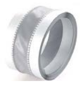
VIBRO-SORB FLEXIBLE DUCT CONNECTOR