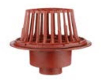
R1200 LARGE SUMP ROOF DRAIN