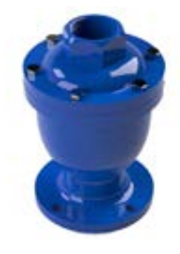
AIR AND VACUUM VALVE

Founded in 1991, Envotec design and manufacture dependable plumbing, heating, and industrial flow control products of the highest standards. The company specialize in Control Systems, Interceptors, lead-free plumbing valves, brass valves, flanges, thermostatic mixing valves, and flexible connectors.