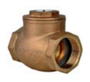
BRONZE CHECK VALVE

Maplef General Supplier is flow control device manufacturer based in Canada. It makes valves included, gate valves, Strainers, Check Valves, Butterfly valves, Brass Angle Valves, Suction Diffusers, Flexible Connectors, Flanges, Fittings and Accessories.