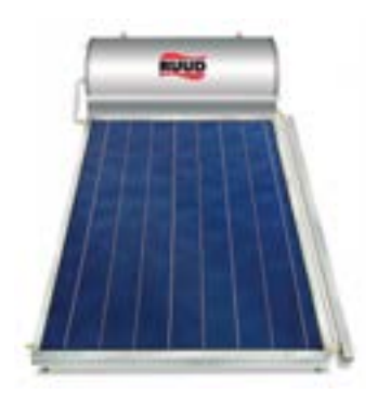
RUDD SOLAR WATER HEATER