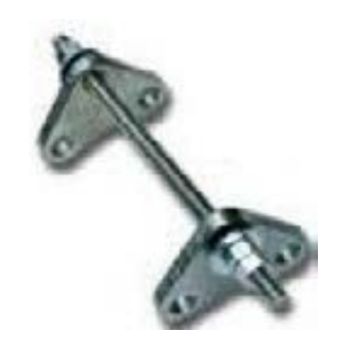
CRU CONTROL ROD UNIT