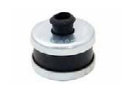
AVHM ANTI-VIBRATION HANGER MOUNT