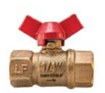
SMV MINI BALL VALVE