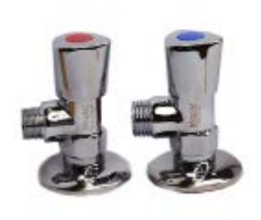
BRASS ANGLE VALVE