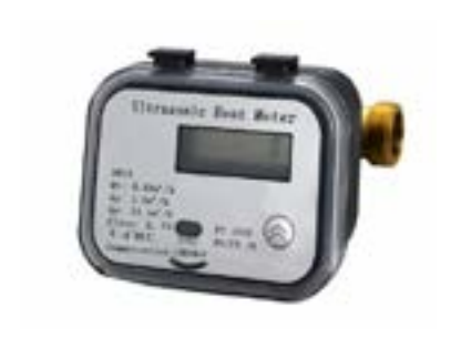
BTU METER - ULTRASONIC HEAT METER

Alyamitech supplies various kinds of BTU Meters like Ultrasonic Flow Meters, Electomagnetic Flow Meters and Turbine Flow Meters in Saudi Araiba. These BTU Meters are available in wall mounted, hand held, fixed and module based fixtures.