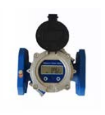
ULTRASONIC WATER METER