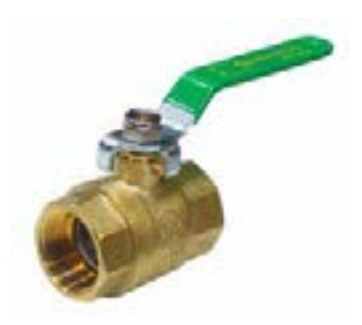
FULL PORT BRASS BALL VALVE