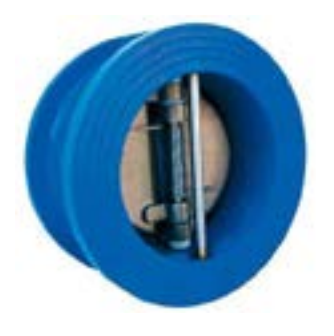
WAFER TYPE DOUBLE DISC CHECK VALVE