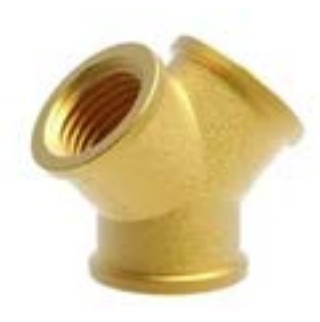
FEMALE – FEMALE 'Y' FITTING