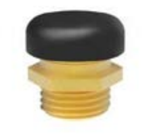
VACUUM RELIEF VALVE