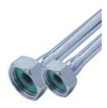
RIGID FAUCET CONNECTORS