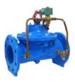
SOLENOID ON/OFF CONTROL VALVE