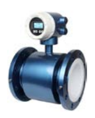
ELECTROMAGNETIC FLOW METER