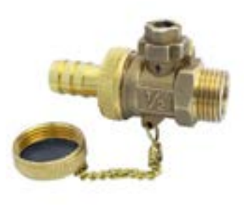
MALE TAPERED BOILER DRAIN