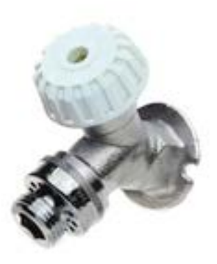
HOSE BIBB VACUUM BREAKER