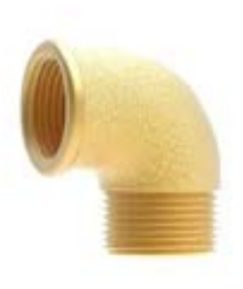
90° MALE – FEMALE REDUCING ELBOW