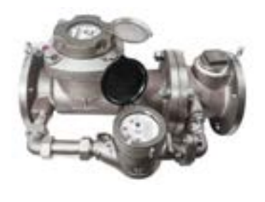
COMPOUND WATER METER