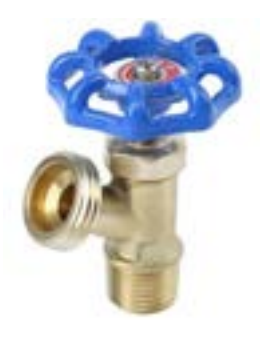
BOILER DRAIN VALVE