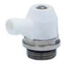
MANUAL AIR VENT