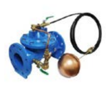
MODULATING FLOAT CONTROL VALVE