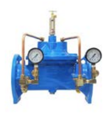
PRESSURE REDUCING CONTROL VALVE

Envotec in Safety & Flow Control Products offers Pressure Reducing Control Valve, Modulating Float Control Valve, Solenoid On/off Control Valve, 2-1/2" To 6" Float Valves, Equilibrium Float Valve, Pressure Reducing Valve With Built-in Strainer And Direct Acting Type Pressure Relief Valves.