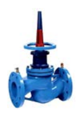
FLANGED STATIC BALANCING VALVE