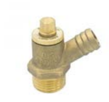
DRAIN COCK WITH HOSE END