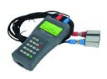
HANDHELD FLOW METER