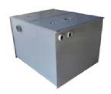
OIL INTERCEPTOR WITH BUILT-IN STORAGE TANK