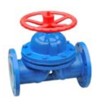
DIAPHRAGM VALVE WITH LINING