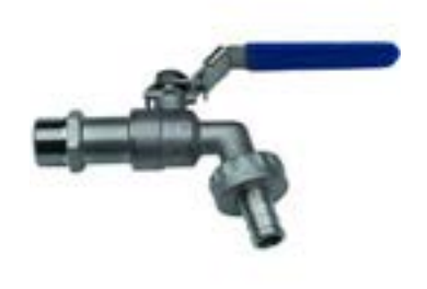
STAINLESS STEEL BIB TAP