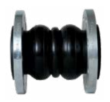
DOUBLE SPHERE FLANGED RUBBER EXPANSION JOINT

Envotec has Expansion Joints Products such as Double Sphere Flanged Rubber Expansion Joint, Double Sphere Screwed Rubber Expansion Joint, Heavy Duty Dismantling Joint And Epdm W/ Brass To Steel Galvanized Rubber Expansion Joint. In Flexible Connector Products Line, It Offers Corrugated Copper Connectors, Rigid Faucet Connectors And Flexible Faucet Connectors.