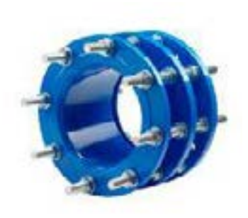
HEAVY DUTY DISMANTLING JOINT