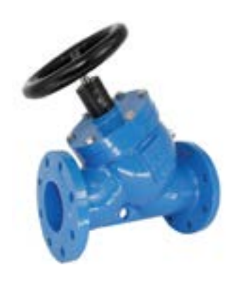
TRIPLE DUTY VALVE