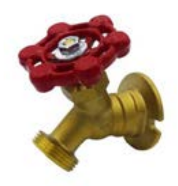
HOSE BIBB HOSE UNION