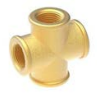
FEMALE CROSS FITTING