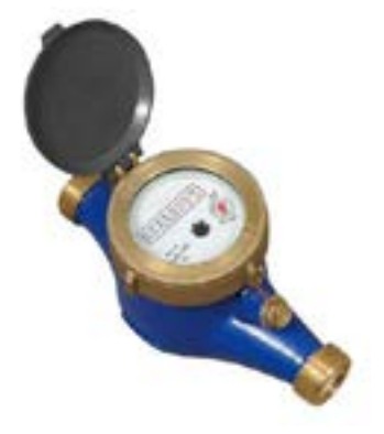
BSPT/NPT THREADED WATER METER

Envotec in Safety & Flow Control Products offers BSPT/NPT Threaded Water Meter, Flanged Water Meter, Flanged Static Balancing Valve, Fixed Orifice Double Regulating Valve, Ductile Iron Flanged Foot Valves, Brass/ Bronze Foot Valves, Electromagnetic Flow Meter, Handheld Flow Meter and Equilibrium Ball Float Valve With Balanced Single Seat.