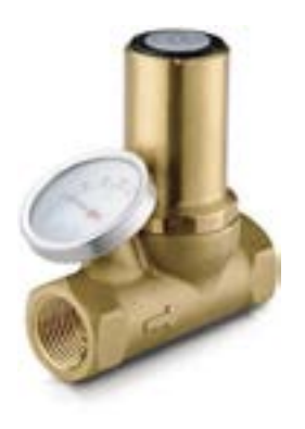
TEMPERATURE BALANCING VALVE