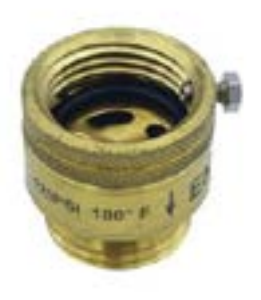
HOSE CONNECTION VACUUM BREAKER