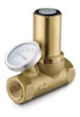
TEMPERATURE BALANCING VALVE