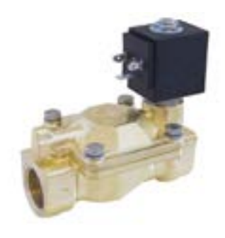
GENERAL PURPOSE SOLENOID VALVE

Envotec offers E21W & E22W General Purpose Solenoid Valves. They also offer Lug Butterfly Valves, Two Way Ball Valves, Brass Angle Valve, Metallic Seated Flap Valves, Brass Needle Valves, Cast Iron/ Ductile Iron Gate Valve, Diaphragm Valves with Lining and Cast Iron Flanged Y Strainers.