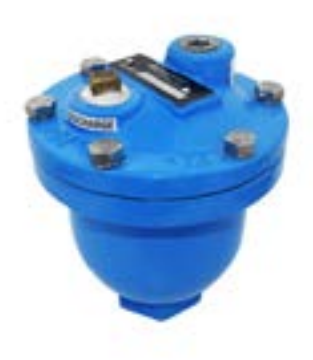
AUTOMATIC AIR VENT

Envotec HVAC Solutions include Automatic Air Vent, Automatic Air Vent ETA-6, Bronze Automatic Air Vent, Automatic Air Vent ETA-4, Brass Automatic Air Vent, Air and Vacuum Valve, Air Separators, Air Separators with Strainer, Manual Airvent, Thermostatic Mixing Valve, Vacuum-Relief-Valve-EV15 and Vacuum Relief Valve.