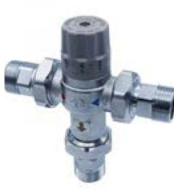
THERMOSTATIC MIXING VALVE