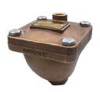
BRONZE AUTOMATIC AIR VENT