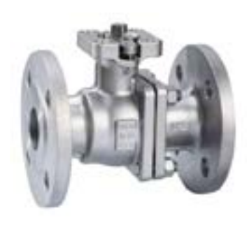
TWO WAY BALL VALVE