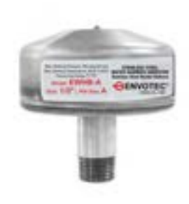
STAINLESS STEEL WATER HAMMER ARRESTORS