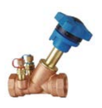
FIXED ORIFICE DOUBLE REGULATING VALVE