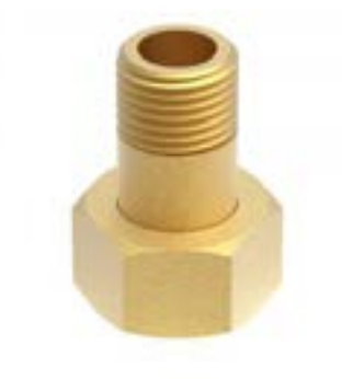
CONNECTION FOR WATER METER